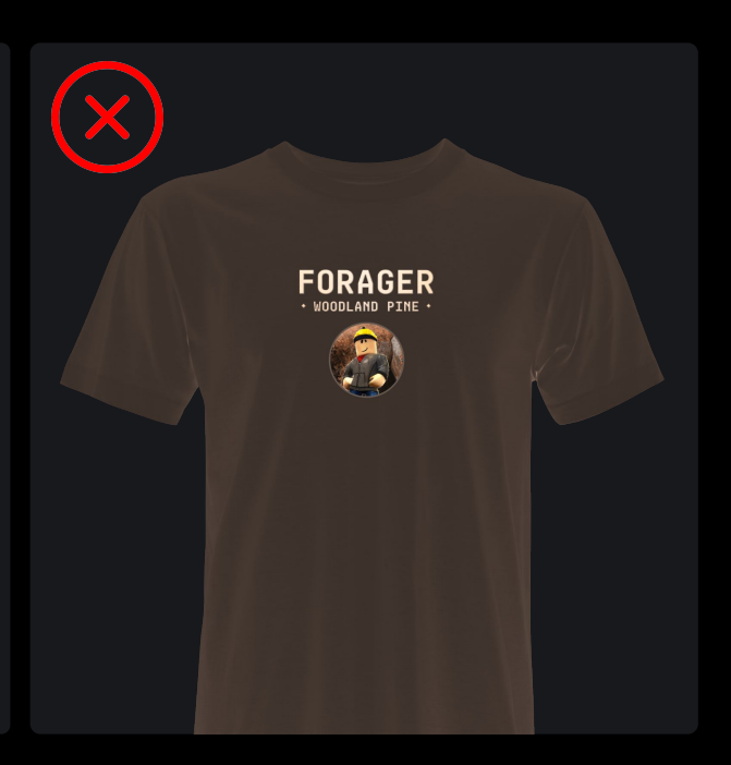
Do not create physical merchandise with R6/15 Avatars