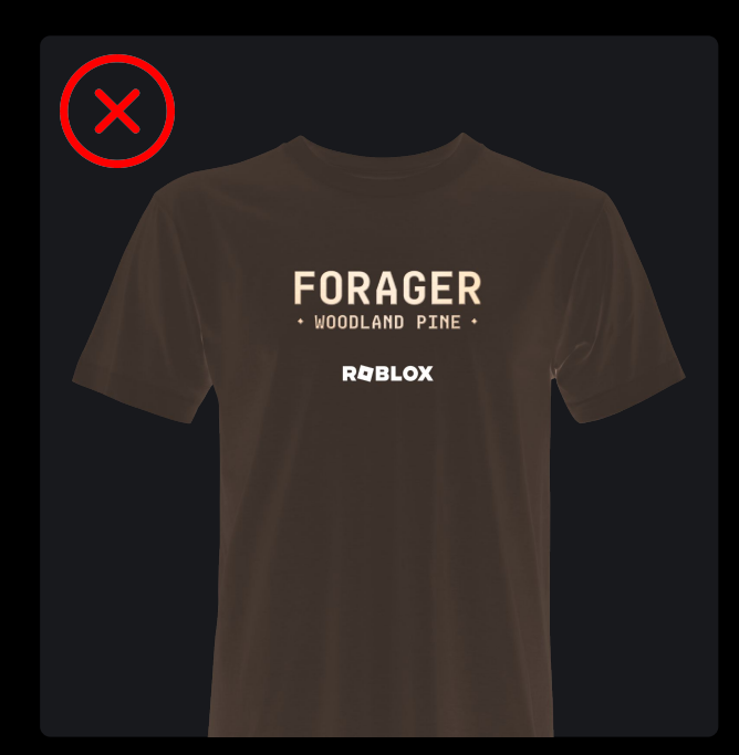
Do not create physical merchandise with the Roblox logo