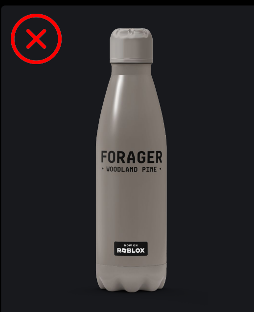
Do not create physical merchandise with the "On Roblox" badge