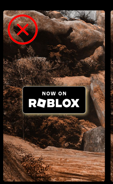
Do not add shadows or other features.