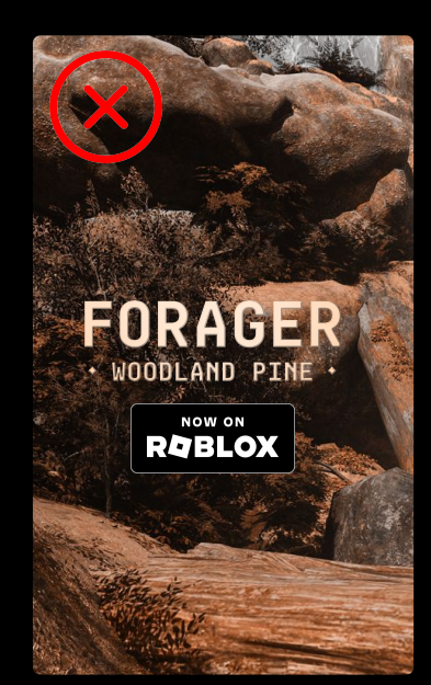
Do not lock up the badge with your experience name or brand