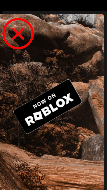
Do not rotate the badge in anyway