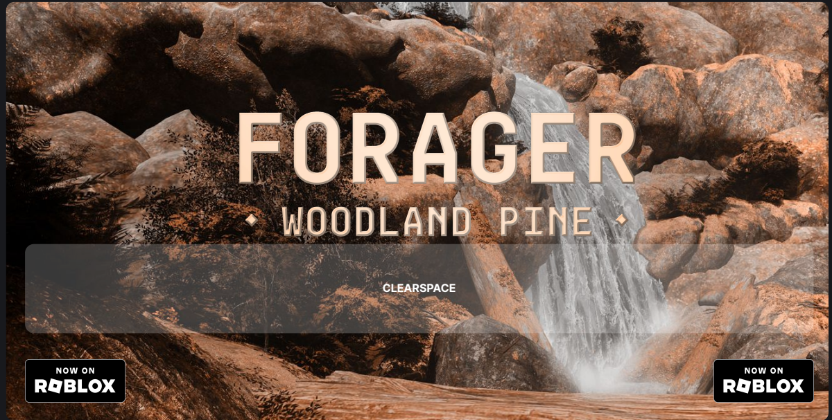
Placement Option 1